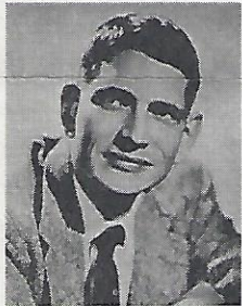
Frank E. Vandiver

Our April 7 meeting is a big round number - 200. And, there's something else that's special about it. The speaker, Frank E. Vandiver, is an old time member and long time friend. He was something of a "boy wonder" back in the late 1940's when he could stump our older members with his knowledge of the Civil War. Since then he has many a book, article, and lecture to his credit.