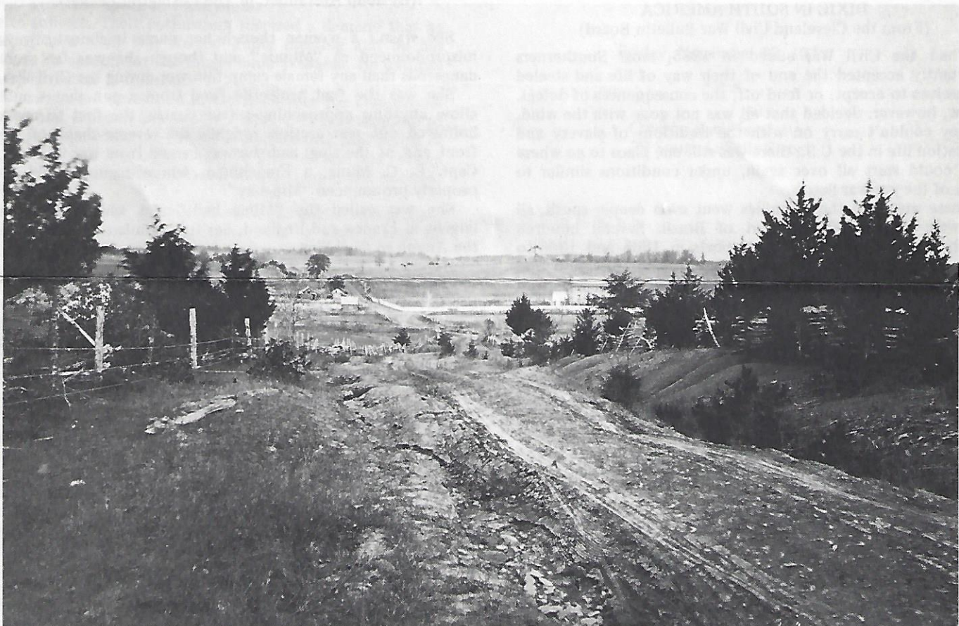
BULL RUN—BUT WHEN? This photograph, probably taken near the end of the 19th century, bears the legend: Scene of the last charge of the Pennsylvania Reserves on the hill near the Henry House. And that is about all we know about it. Perhaps our readers can tell more.