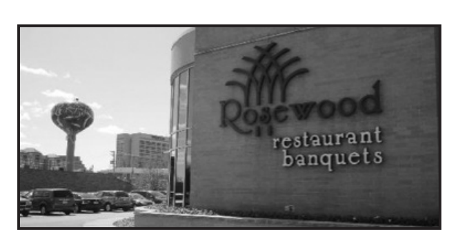
Rosewood Banquet Hall and Restaurant

For Map/Directions to the Rosewood Restaurant, see below, visit www.rosewoodrestaurant.com or phone 847 696-9494.