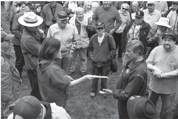
The group, discussing weighty affairs