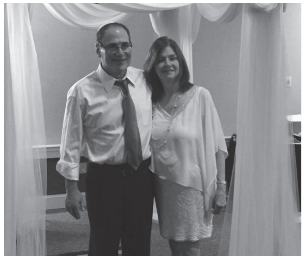
The Happy Couple