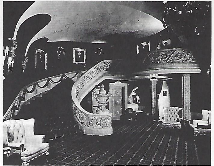
Grand staircase in Kungsholm foyer. Civil War Round Table Ladies' Night will be held in famous restaurant at 100 East Ontario Street, Friday, November 10.