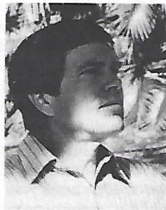
James M. McPherson

Northerners and Southerners alike claimed to be fighting for liberty in the American Civil War. The South took up arms for what they saw as a fight for the right of state sovereignty; the North for the preservation of the Union "conceived in Liberty." According to Jefferson Davis, the South was "forced to take up arms to vindicate the political rights, the freedom, equality, and State sovereignty which were the heritage purchased by the blood of our revolutionary sires." Northerners decried the Confederacy's claim to be fighting for freedom. "Their motto," wrote poet and editor William Cullen Bryant, "is not liberty, but slavery." In his message to Congress on July 4, 1861, Abraham Lincoln questioned whether "discontented individuals, too few in numbers to control administration" could be allowed to "break up their government, and thus practically put an end to free government upon the earth." "Must a government," he continued, "be too strong for the liberty of its own people or too weak to maintain its own existence?" By the time of the Gettysburg Address in November, 1863, the Emancipation Proclamation had been in effect for nearly eleven months and the North was fighting for a "new birth of freedom."