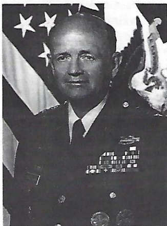
General Gordon R. Sullivan

Grant's winning strategies in the campaigns of 1864, and how the lessons they provide are still being used by today's United States Army will be the points of focus of the address on March 11. General Gordon R. Sullivan will provide a unique interpretive perspective when he speaks on "Grant's Challenges as Commanding General in 1864." He will structure his remarks so as to develop three themes: the broad strategic setting of 1864; the ways that setting and Grant's actions can help us understand the nature of our army and our republic at war; and the ways the