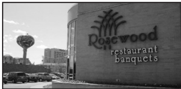
Rosewood Banquet Hall and Restaurant

For Map/Directions to the Rosewood Restaurant, see below, visit www.rosewoodrestaurant.com or phone 847 696-9494.