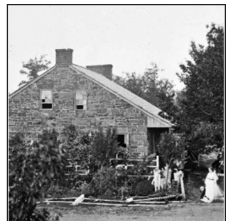
Lee's Headquarters