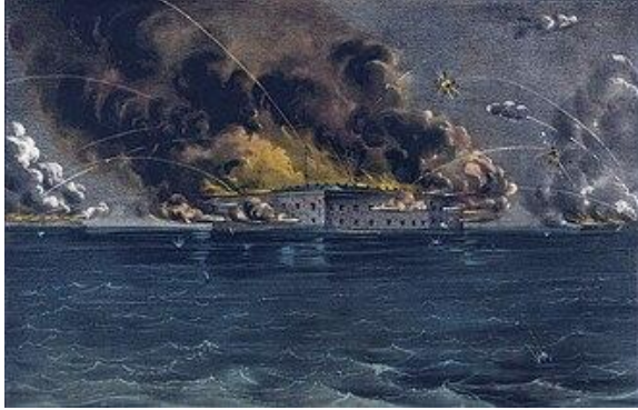
Fort Sumter bombardment