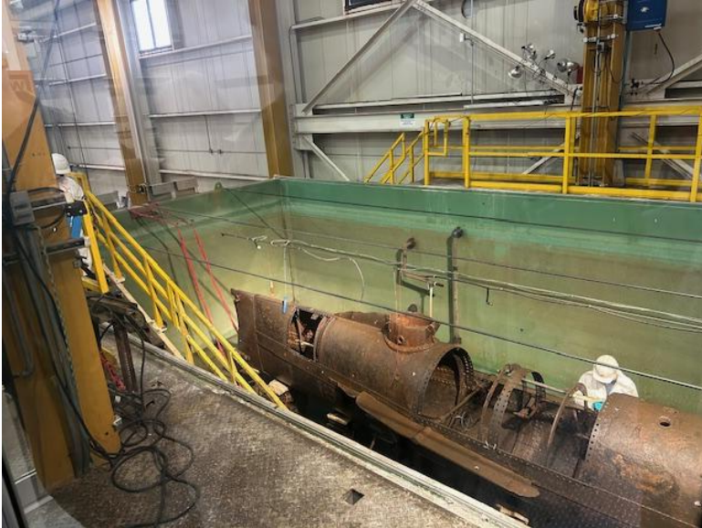
The Hunley being worked on