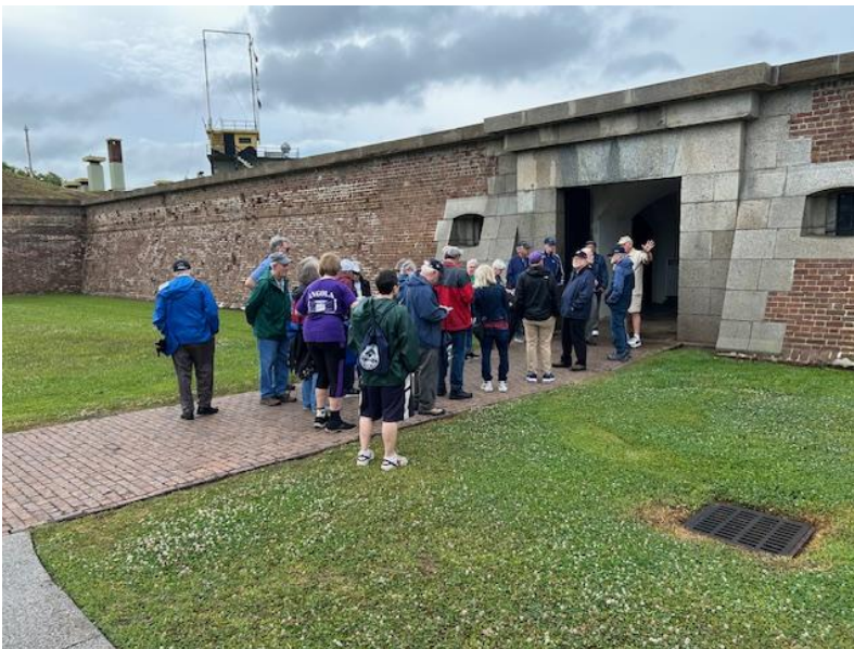
Entering Fort Moultrie